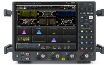
3.5 mm input model