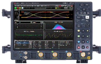
1 mm input model

Choose your Infiniium UXR real-time oscilloscope model. There are 3 main models based on input connector size: 1mm, 1.85 mm, and 3.5 mm. Infiniium UXR-Series models offer bandwidths from 5 GHz to 110 GHz with various 1-channel, 2-channel, or 4-channel configurations available.