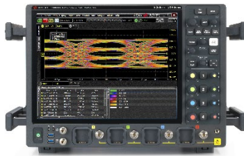
1.85 mm input model